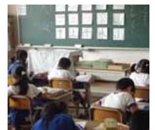
An elementary school Brothers visited in Minamisoma, Fukushima.