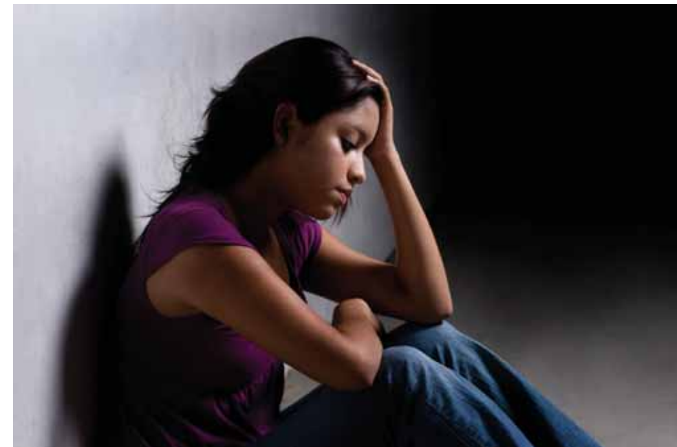
CHALLENGES TO EDUCATION: The face of homelessness is not just adults on the street. The face of homelessness is also families with children, page 10.